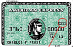
Card ID #

Signature Panel Code: _____ (AMEX 4 Digit on Front of Card, DISC MC/VISA 3 Digit on Back of Card)